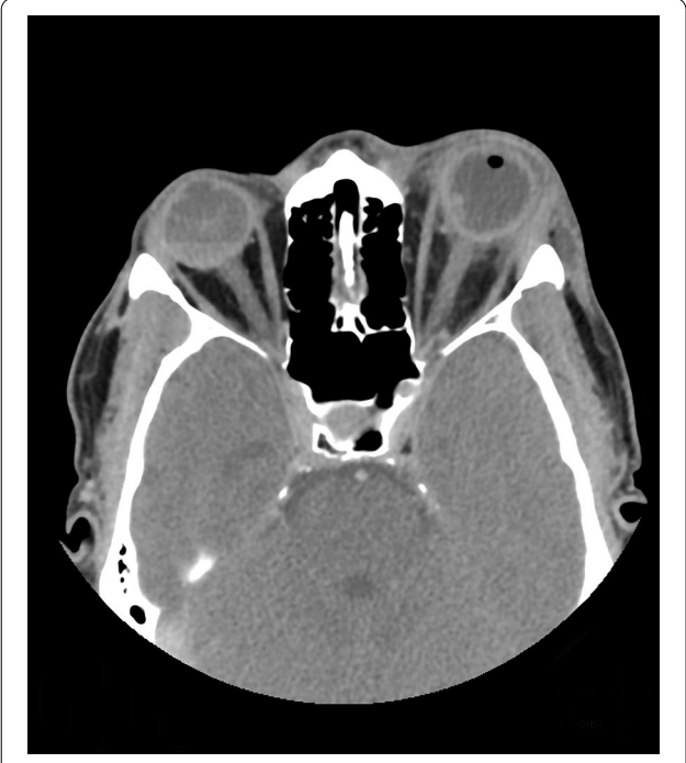
Fig. 3 Computerized tomography (CT) of orbit revealed diffuse preseptal thickening with evidence of extension along the episcleral and proximal part of the optic nerve with infiltration of the tendinous space associated with diffuse thickening along the choroidoretinal thickening

Nicolet Sensitivity and Sweep Time Per Division 1 20.00 uV 50.0 msec 2 20.00 uV 50.0 msec 4 20.00 uV 50.0 msec Fig. 2 Visual evoked response (VER) demonstrating flat response in the left eye